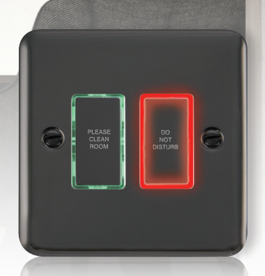
2 x GridPro® illuminated modules