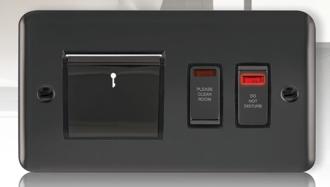
New Media<sup>™</sup> Key Card module with 2 x GridPro<sup>®</sup> Switch Modules with Neon

A SMART, MODERN, SECURE AND ACCURATE SOLUTION